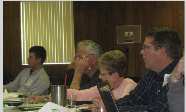
About twenty beginning organic farmers attended the Farm Starts Organic Transition Training held in Hays on March 24, co-sponsored by Kansas Organic Producers and NFO. The training was part of the NFO Beginning Farmer and Rancher Project aimed at helping beginning farmers (defined as those in farming less than ten years) transition to organic farming. Several father/son teams attended as did several young farmers taking over their parents’ operations. Another workshop will be held in northeast Kansas in late August or early September. Stay tuned for more information.

Monsanto is being sued by citizens who maintain that glyphosate, the active ingredient in Roundup, is responsible for their cancers. On Tuesday – March 14 – the judge overseeing the case unsealed some of the documents that have been filed related to the case, and nobody comes out clean – not the company and not EPA. The court documents included Monsanto’s internal emails between the company and federal regulators. The records suggested that Monsanto had ghostwritten research that was later attributed to academics and indicated that a senior EPA had worked to quash a review of glyphosate that was to have been conducted by HHS. EPA determined in 1985 that glyphosate should be classified as a group C carcinogen – possibly cancer-causing in humans but lacking sufficient studies of humans and animals – only to reverse that decision six years later. EPA has been constantly at odds with the majority of the scientific community over the potential dangers of glyphosate. (From Esquire March 20, 2017, and New York Times March 14, 2017.)