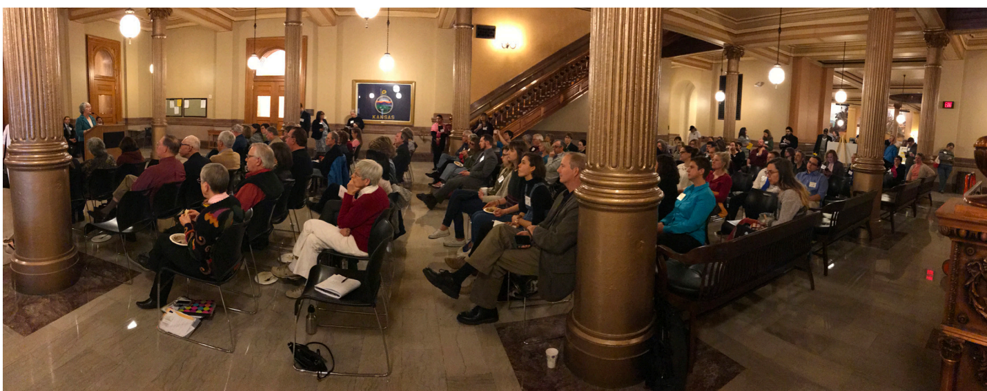
WEALTH Day participants gathered to hear State Legislators talk about water, energy, food and health issues.