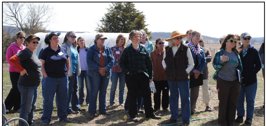
Getting ready to tour Red Tractor Farm, near Lawrence, during a 2015 KRC Women in Farming workshop.