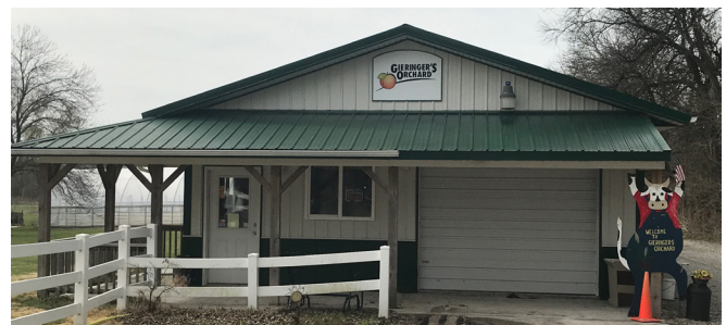
Storefront at Gieringer Orchard

With their continued growth, innovation and prime location, thousands of customers each weekend from strawberry season to the end of apple season isn’t much of a stretch of the imagination.