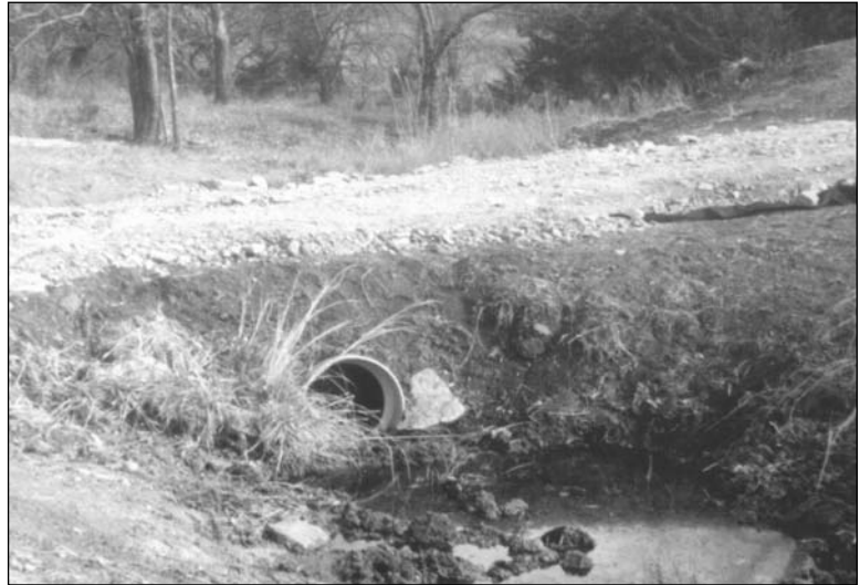
Ken built a couple of stream crossings (right) for his cattle, using gravel over engineering fabric. The fabric (left) will help keep the gravel from sinking into the mud during wet weather, and is cheaper than concrete.

The water quality practices Ken implemented associated with his beef production include fencing one side of the stream, installing a gravel pad around a freeze proof waterer, and installing stream/cattle crossings.