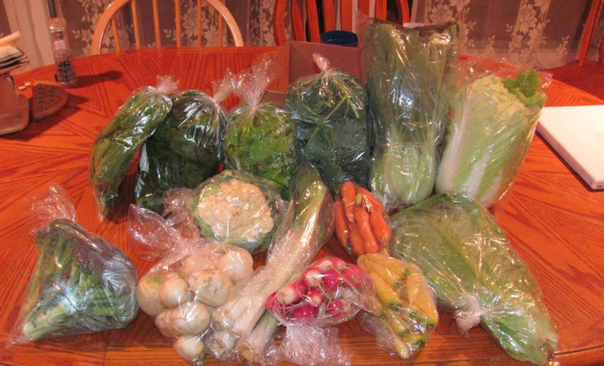
Produce ordered for Thanksgiving