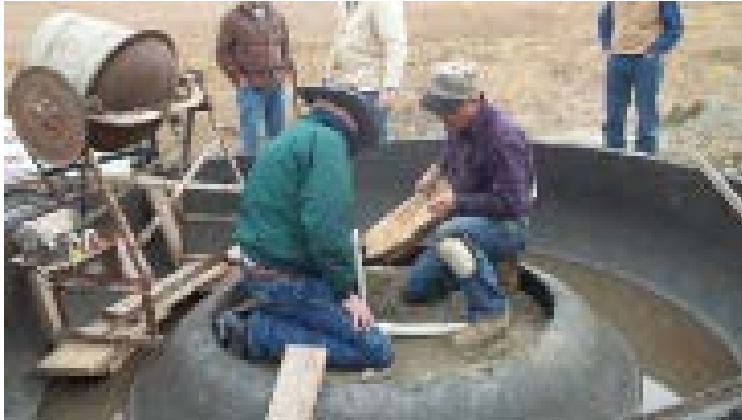
Plumbing the inside of the tank. Note the flexible connection used to account for shifting of the line or tank.