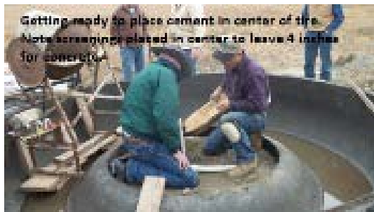
Inside of tire is filled with sand or lime screenings and tamped to allow 4 to 6 inches of concrete depth.