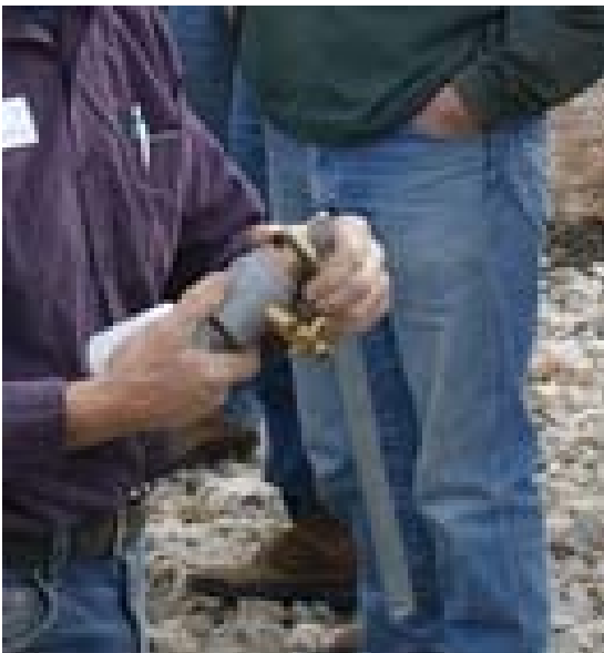
Showing the valve with a winter minimum continuous flow valve installed.