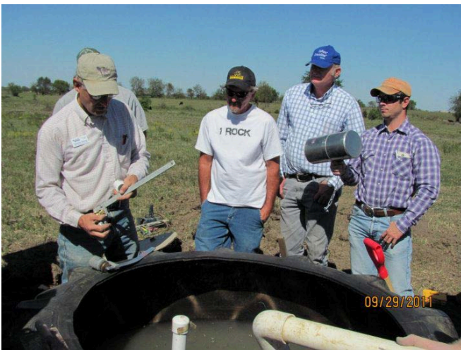
Showing the recommended valve and float assembly.